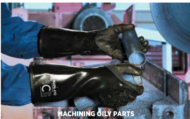
MACHINING OILY PARTS